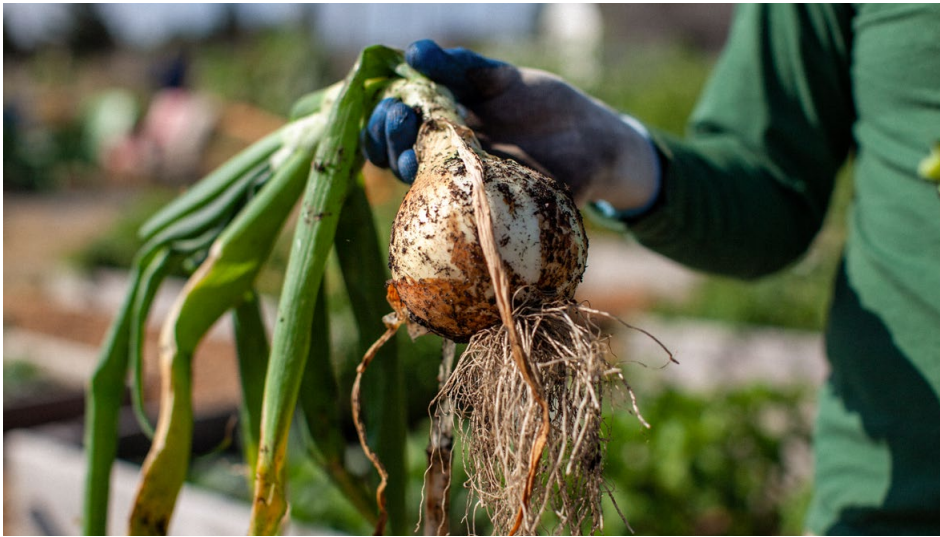
An OFB Food Systems Ambassador showing off produce from his garden