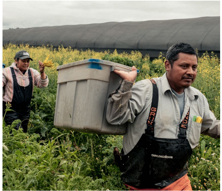
Migrant farmworkers in the field

Bilingual volunteers are on hand to create a welcoming and comfortable environment. And this